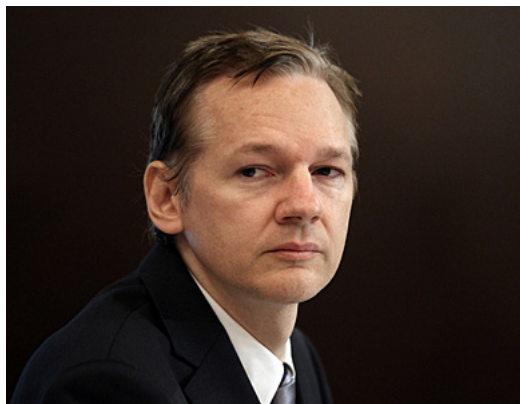
Assange Eyeing The Parrot

Yesterday, in a quickly-assembled news conference on the steps of the state capitol, Julian Assange, founder of Wikileaks, claimed The Parrot is, in reality, The NY Times cleverly masquerading as the ARC publication in a nefarious effort to capture the younger, more discerning "academic crowd" of ARC and its 30,000 readers. To the amazement of incredulous reporters on hand, Assange sneered, "It's self-evident. One look at the Parrot – its breadth and depth of reporting, the antiquated syntax (check out "who" and "whom," for example), the erudite lexical choices, the overall sobriety of message and subtle tones of its photography and there can be no doubt -- the Parrot is the NY Times! I challenge you to prove it not!"